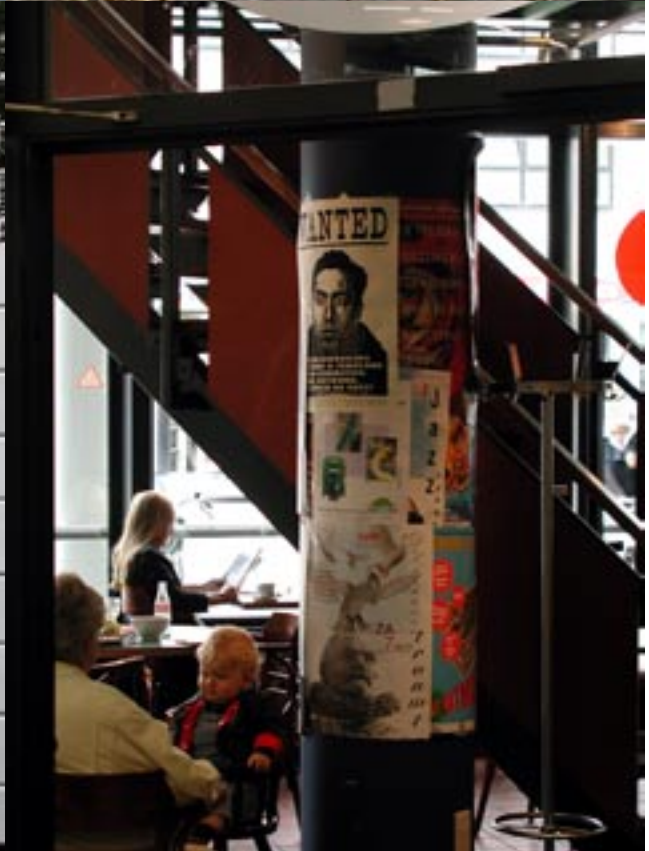
(clockwise from above left) Mauritzweg / Benhuizerstraat / Boomgaardstraat / Centrale Bibliotheque Café, Rotterdam, NL.