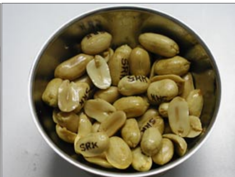
Artists should Smoke , from the 'Artists should...' Series, 16 autographed cigarettes, lighter, case, 2002 / The Smoker (details) / SRK'S Nuts , autographed peanuts, cups, 2002. For ROOM: the Shop, I created consumable products (get it?). Nuts completely consumed, cigarettes 8 out of 12 smoked.