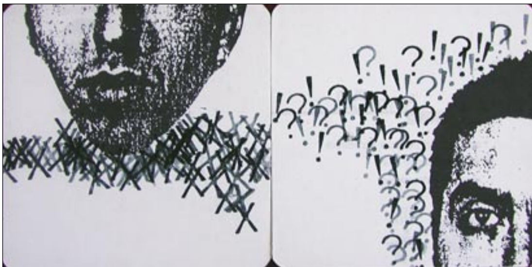
Your Beer Here , beer coasters, 2004. A Public Service Project helping out those poor drunk bastards with a little instruction on where to put down the beer. B-side consists of hand stamped thoughts on text. Edition of 500.